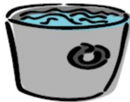
3. SANITIZE at least one minute in sanitizing solution