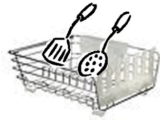
4. AIR DRY towel drying is prohibited