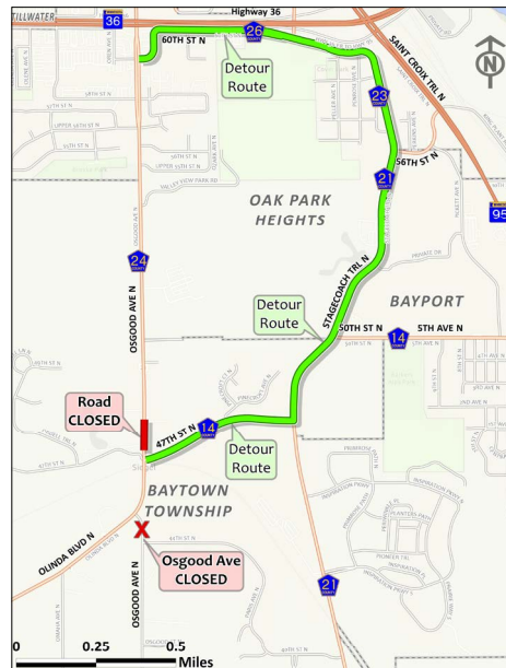
STAGE 2 - Osgood Avenue Closed between 47th Street and 1/4 mile South of 50th Street