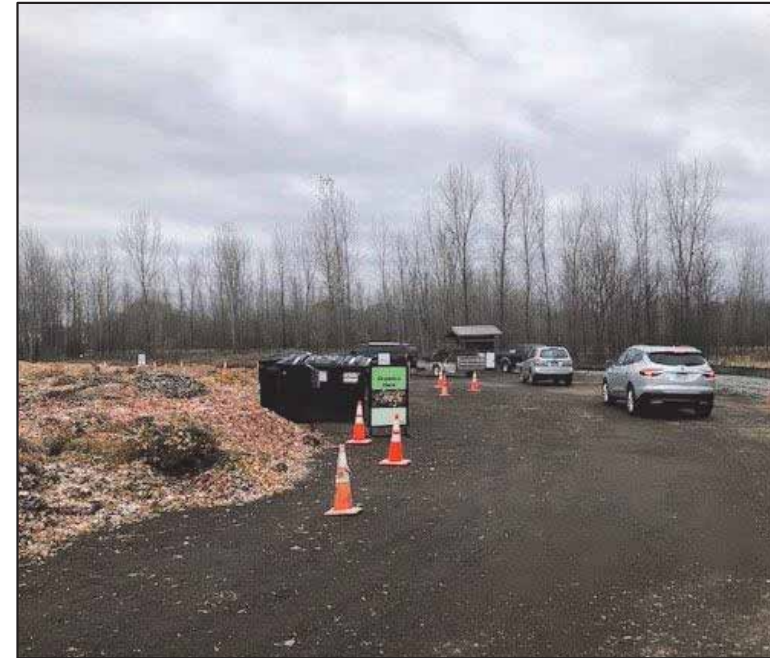
Northern County Yard Waste Site