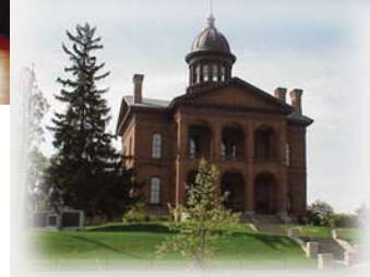
Historic Courthouse hosts many events throughout the year – The Historic Courthouse in Stillwater (center) has been transformed into one of the finest examples of re-adaptive use in the Midwest. Staff works with clients to create memorable weddings and receptions (above left). Young ladies prepare to model the latest bridal fashions at the Stillwater Bridal Affair, an event that is hosted each year at the Historic Courthouse (above right).

stenciling details and lighting, a dance floor, and large windows with views of the city and the St. Croix River. A beautiful double staircase curves upward from the main floor, making a grand entry into the second floor courtroom. Outdoor ceremonies are also popular on the North Portico, overlooking the river and the courthouse grounds.