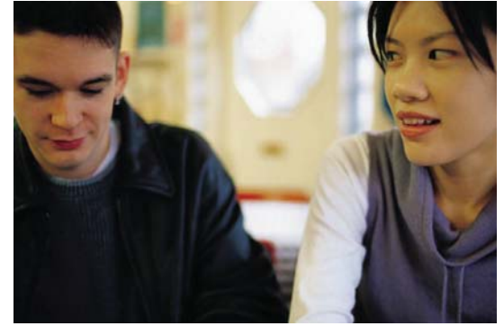
A successful intervention for juveniles – Respectful communication and behavior teaches PLACE participants how to be responsible, productive citizens with goals and direction.

There are two PLACE Programs located in Washington County. PLACE South, established in 1984, is located in Cottage Grove. This program is a collaborative effort with