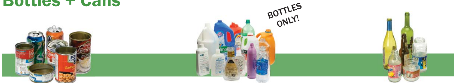
Steel & Aluminum Cans, Foil & Trays rinse clean, labels are OK