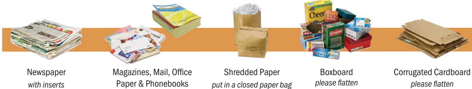
Newspaper with inserts