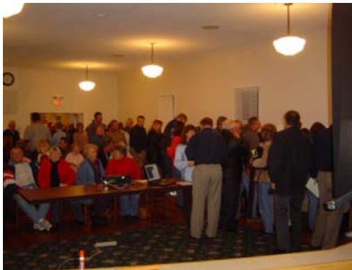
The public process was central to developing the master plan.

In June of 2004, the Washington County Board of Commissioners retained Brauer & Associates, Ltd. to collaborate with county staff and local citizens to complete a comprehensive master plan for St. Croix Valley Regional Trail. This document represents the results of the planning process, which was completed in May of 2005.