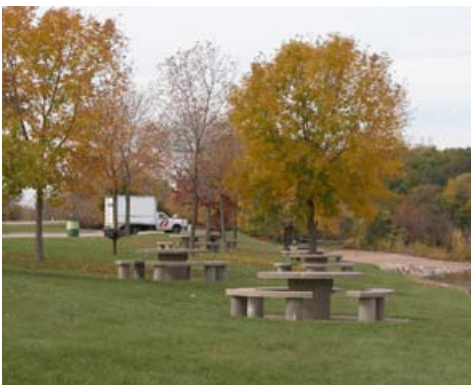
Point Douglas Park could become a popular trailhead location given its accessible location.