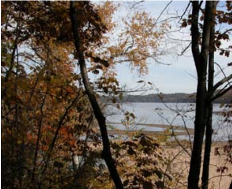
The scenery of the St. Croix River valley is a compelling setting for a regional trail.